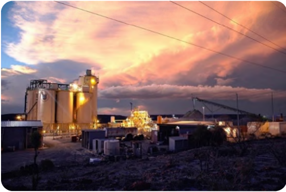
Processing plant at Darlot