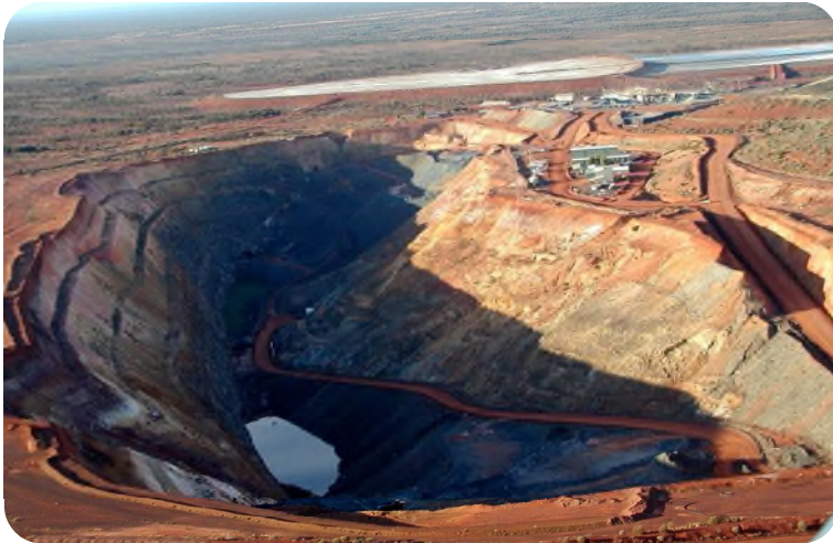
Darlot Gold Mine